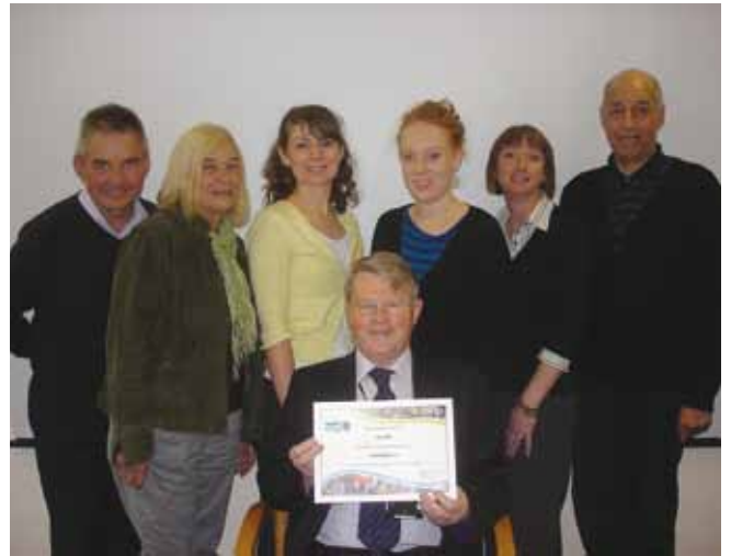
Members of the Salford Fairtrade steering group

and college groups will be joining in to help raise awareness of Fairtrade from 7 – 12 March. To find out more, visit www.salford.gov.uk/fairtrade