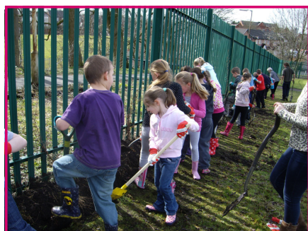
Hawthorn, holly, blackthorn, and guelder rose saplings were planted