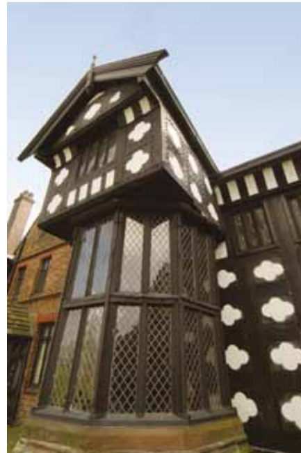
Ordsall Hall reopens in Easter 2011 following an extensive restoration to open up new rooms, landscape the gardens and restore the roof.