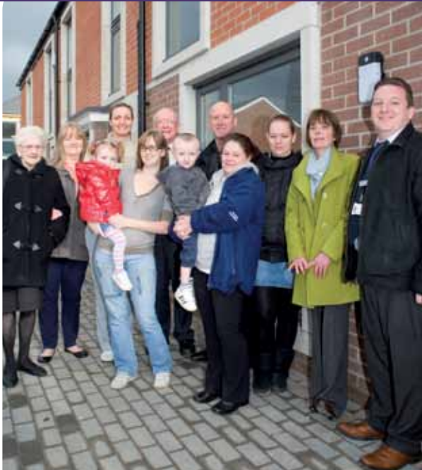
Holcombe Close residents view new family homes