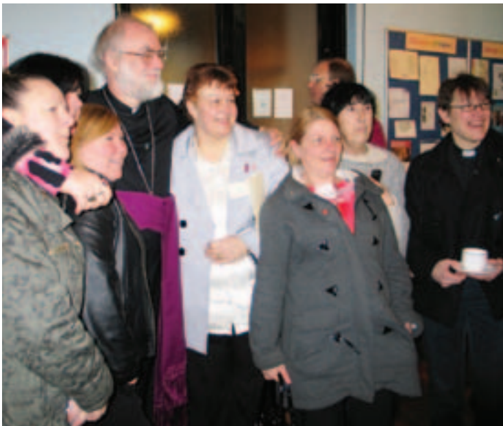
The Archbishop of Canterbury meets some of the congregation at St. Clement's Church in Ordsall.