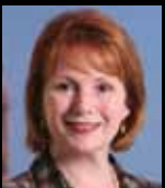
Rt Hon Hazel Blears MP