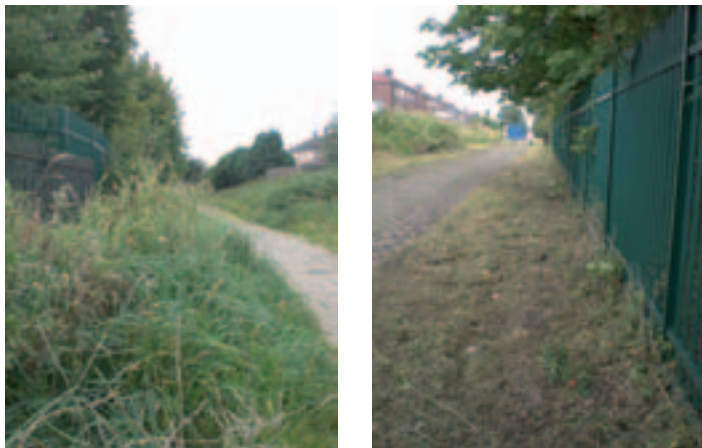
Destructor Road: before (left), after (right).

As suggested by residents, the Community Payback Team started clean up work at Destructor Road, to the rear of Swinton High School. This involved cutting back shrubbery and painting the railings to open up the well used pedestrian route.