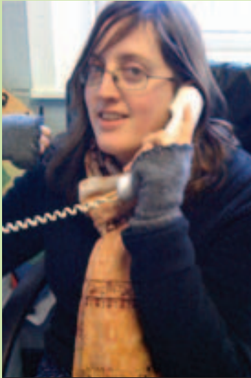
Photo: One of the new volunteer co-ordinators

The council's neighbourhood management team have created five new jobs through the Future Jobs Fund in Ordsall, Langworthy and Pendleton.