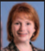
Rt Hon Hazel Blears MP