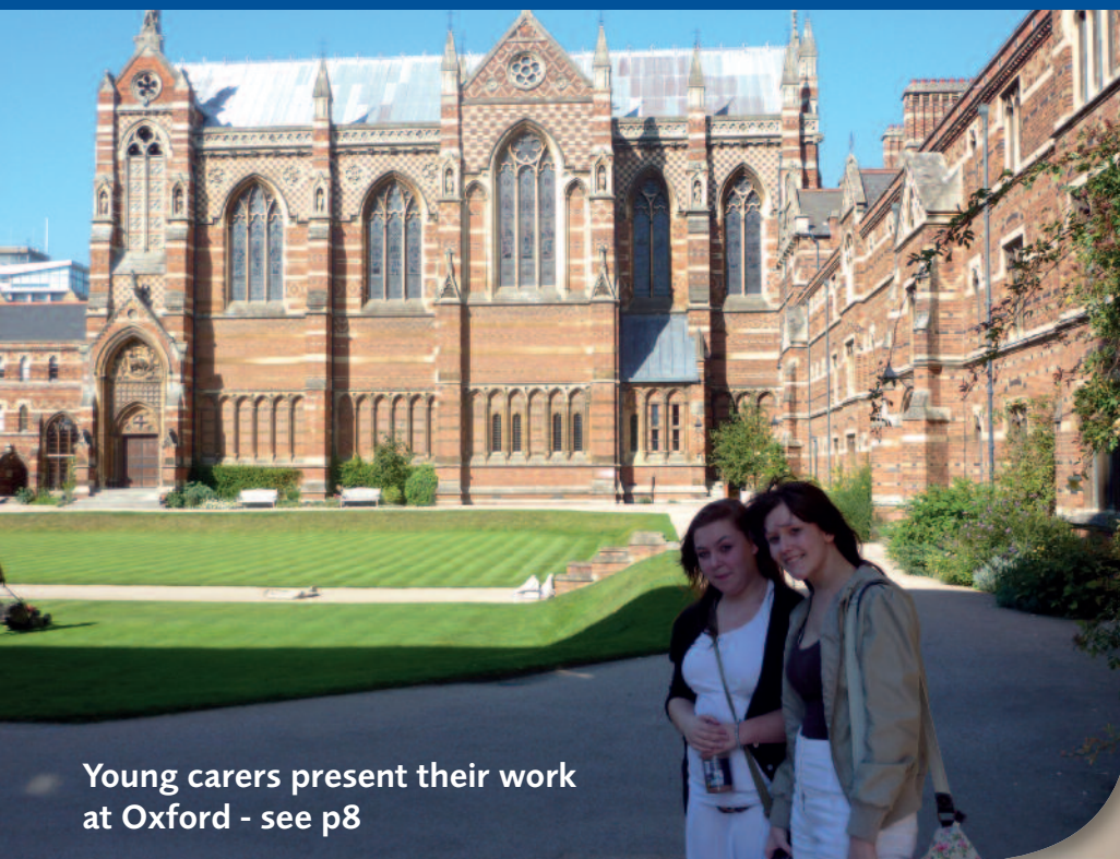
Young carers present their work at Oxford - see p8