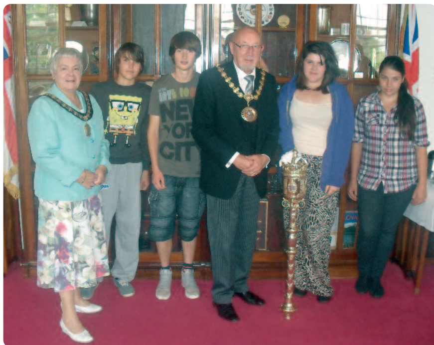
The Mayor and Mayoress of Salford with members of the Young Carers Newsletter group