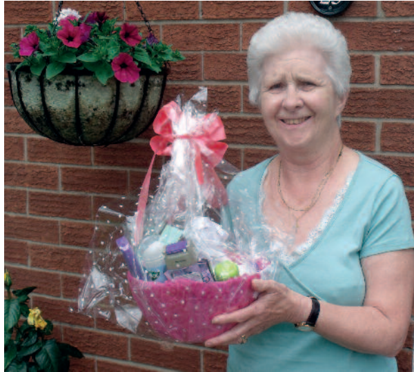
Top left and above: prize winners from our free raffle at Salford Royal Hospital