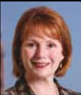
Rt Hon Hazel Blears MP