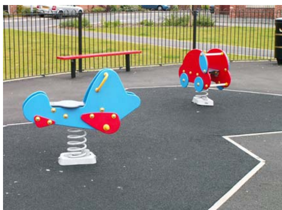
Wet Earth Green