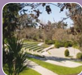
Here are three examples of amphitheatres.