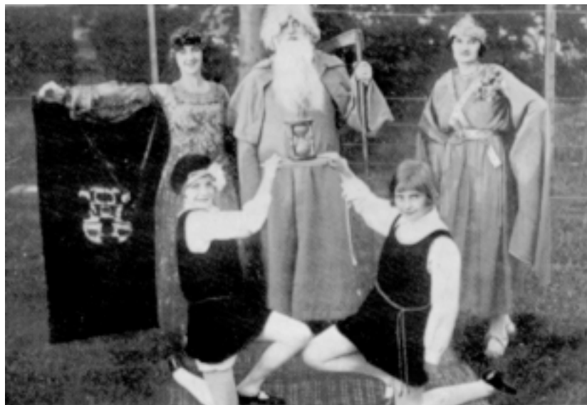
Father Time and The Spirit of Salford, with attendants