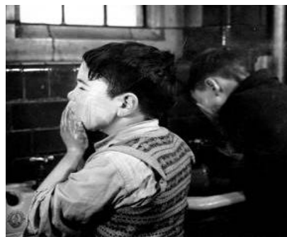
A sample from the collection - Boys washing at Halton Bank