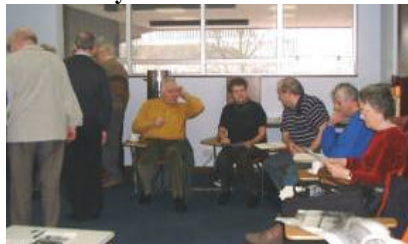
Members of the Swinton group

Contributors to the recent LifeTimes reminiscence project have decided to form their own Heritage Group for the Swinton area.