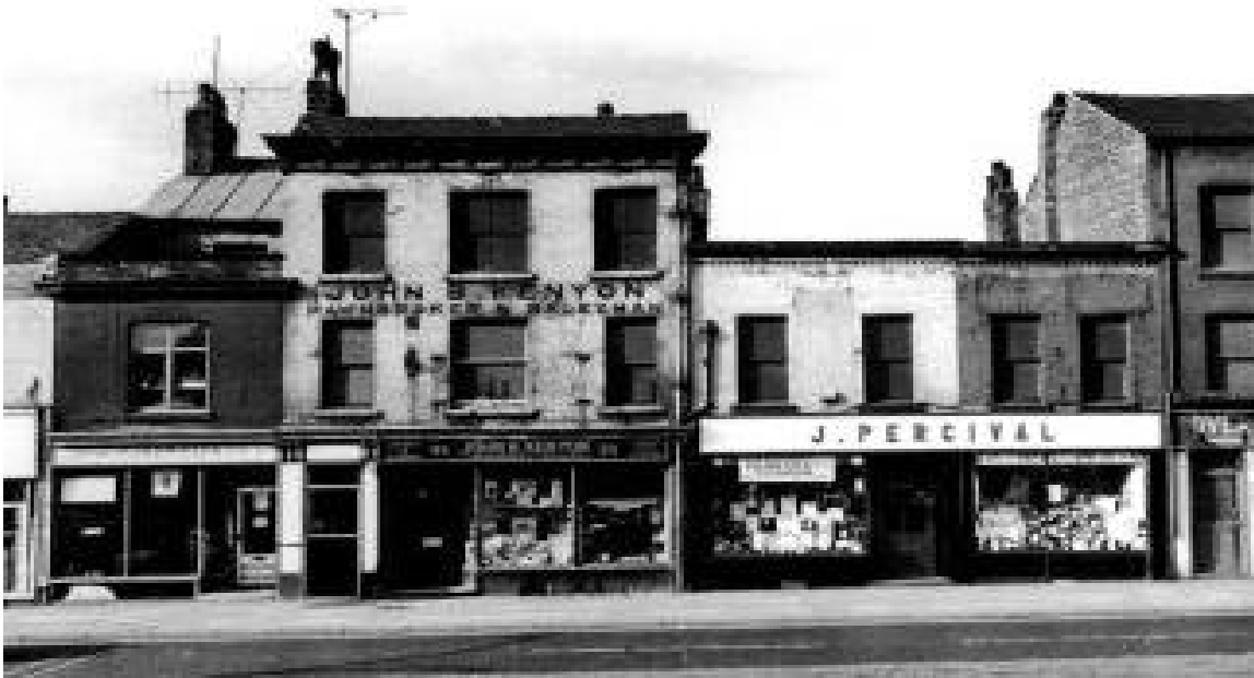
Broad Street in 1970 - Kenyon's Pawnbroker's centre, Percival's clothes shop right, and Cureton's cafe left.

LifeTimes staff are collecting material - recording reminiscences and copying photographs - relating to Broad Street, Chapel Street and The Crescent for an exhibition at Salford Museum and Art Gallery later this year.