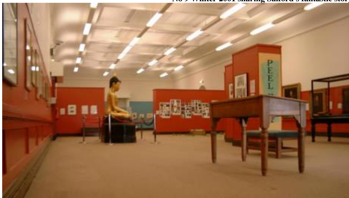
No 9 Winter 2001 sharing Salford's fantastic story

The former Lowry Gallery - October 2001. How will it look in 2002?