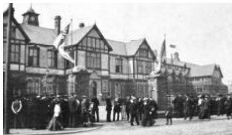
A postcard captioned Racecourse Entrance - Manchester - from the Ted Gray Slide collection

Alice concludes by asking, "I wonder if any of your readers remember a similar occurrence?"