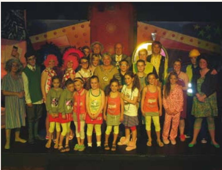
The cast of 'Through the Mill- A Game of Life' with the Mayor of Salford and Consort

For more information on this community project, please call Salix Homes, 0800 218 2000 and ask to speak to a member of the Pendleton team.