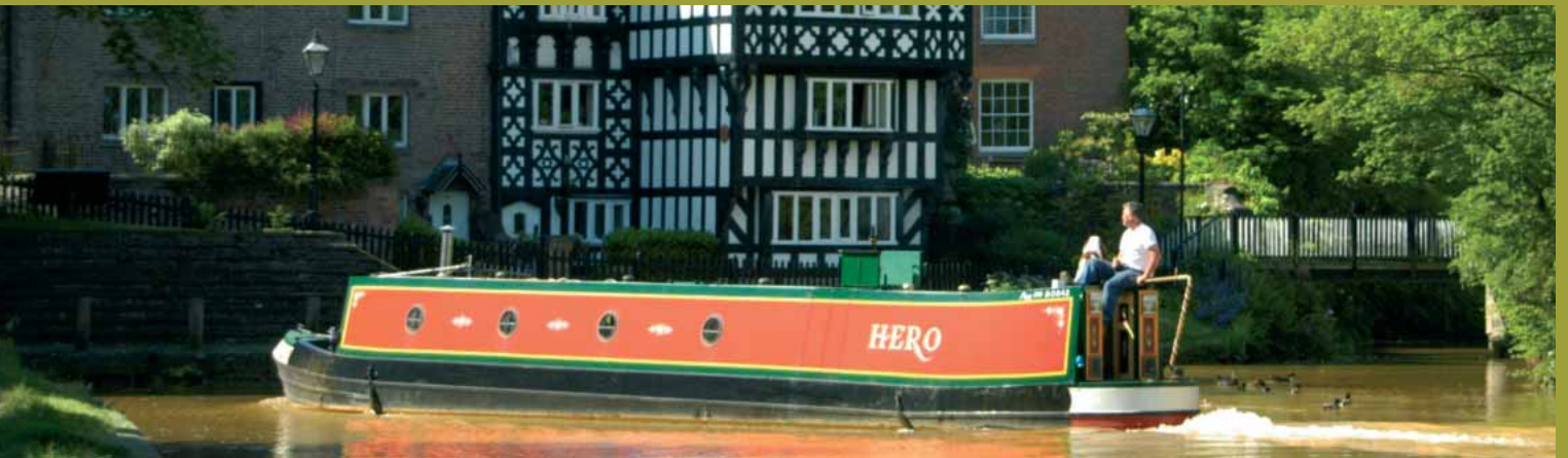
Appendix B - Unlisted Buildings of Local Significance